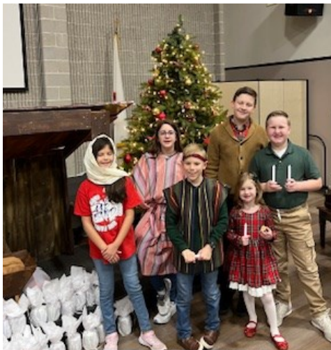
Christmas Eve Service By Kids, For Kids